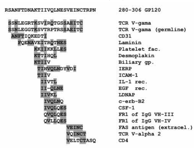
Figure 2. Sequence homologies between the C-terminus of the second conserved region of HIV-1 gp120 and human proteins. The asterisk (*) indicates residues that are identical, and the sign (+) indicates a conservative change (6)

Despite the presence of the strongest T cell epitope of gp120, which is active in vitro (30), and an exposed B cell epitope (31,32), the C-terminus of the second conserved region (C2) of HIV-1 gp120-encompassing amino acids 280-306 is not immunogenic in humans (30,33,34). One possible conclusion drawn from these findings might be that the human immune system is unresponsive or tolerant to this epitope. It has been postulated that immunological tolerance to this HIV-1 gp120 domain might be the consequence of similarity between the region comprising the T cell epitope and its immediate vicinity, and some proteins participating in the human immune response. This assumption was confirmed by the local similarity between the C-terminus of the second conserved region of HIV-1 gp120 and several human proteins, presented in Figure 2 (19,35).