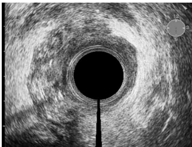
Figure 4. uT4 rectal cancer (invasion into posterior vaginal wall)