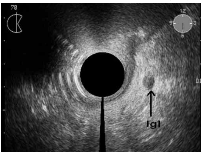
Figure 5. uN1 (metastatic lymph node in perirectal fat)

Normal, nonenlarged lymph nodes are similar in echogenicity to the hyperechoic perirectal tissues, and therefore are not usually seen. Enlarged inflammatory lymph nodes are also usually hyperechoic, with ill-defined margins. In contrast, malignant lymph nodes are usually located near the primary tumor site, round, with smooth, sharply defined margins, usually larger size (>5 mm) and echogenic characteristics similar to those of the primary tumor, which is usually hypoechoic (Figure 5). If no lymph nodes are seen, the designation uN0 is given or uN1 if enlarged, suspected nodes are noted. According to the literature, accuracy for detection of malignant lymph nodes ranges from 64% to 84% (Table 2).