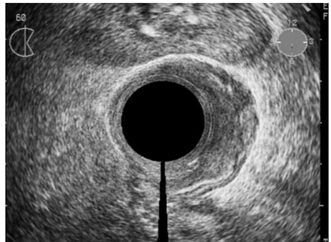
Figure 2. uT2 rectal cancer

If tumor is growing through the bowel wall (uT3 and uT4 lesions) multimodal treatment should be considered (Figure 3 and 4).