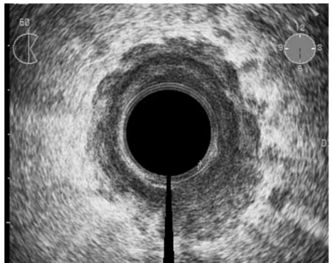
Figure 3. uT3 rectal cancer

If tumor is growing through the bowel wall (uT3 and uT4 lesions) multimodal treatment should be considered (Figure 3 and 4).