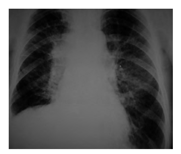
Figure 1A Complete right lung atelectasis, and 1B Reopening of the right main bronchus after the APC led to the resolution of right lung atelectasis

Figure 2. Scheme of bronchoscpic findings before (A) and after APC (B).