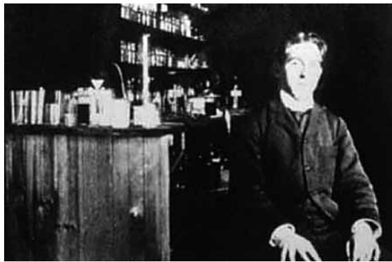
Figure 5. Emil Grubbe

It was already on January 12, 1896, only 17 days from publishing Roentgen's discovery, that Emil Grubbe applied X-rays to irradiate a female patient suffering from locally advanced breast cancer and recorded palliative effect, but he did not publish the results until much later.