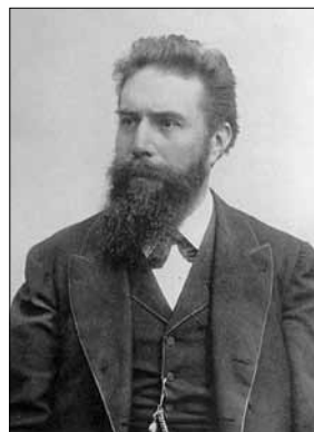
Figure 1. W. C. Roentgen