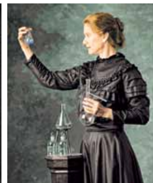
Figure 4. Marie Curie