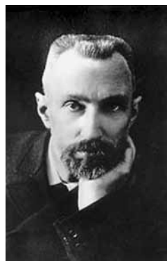
Figure 3. Pierre Curie