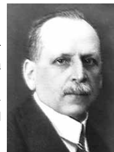
Figure 7. Leopold Freund