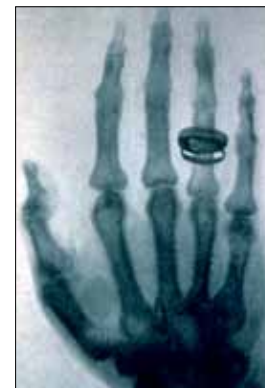
2. Hand of W. C. Roentgen's wife with a ring