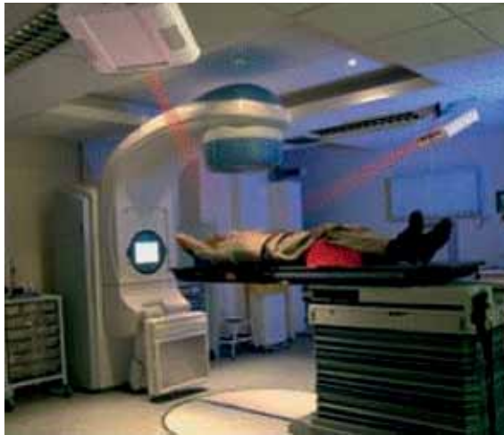
Figure 10. VARIAN device for conformal radiotherapy

A big step forward was made in the past decade by constructing a device with MLC (Multi Leaf Collimators) – small metal leaves of which each one can move independently from others, creating fields of various shapes and at the same time protecting the surrounding organs (Figure 10). Intensity-modulated radiotherapy (IMRT) concept had been described back in 1978, but it was not until the 90's that it was applied in practice, following improvement and development of computer equipment. Today, we are at the level of three-dimensional conformal radiotherapy (Figures 10 and 11).