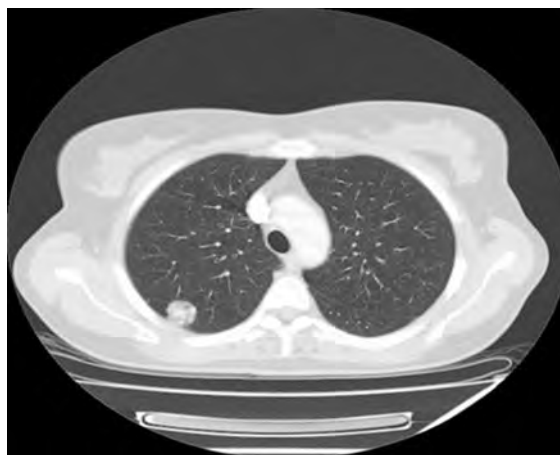
Figure 1. Computed tomography of a patient with peripheral tumor

finding was negative for intra-bronchial anomalies. A primary lung carcinoma was suspected.